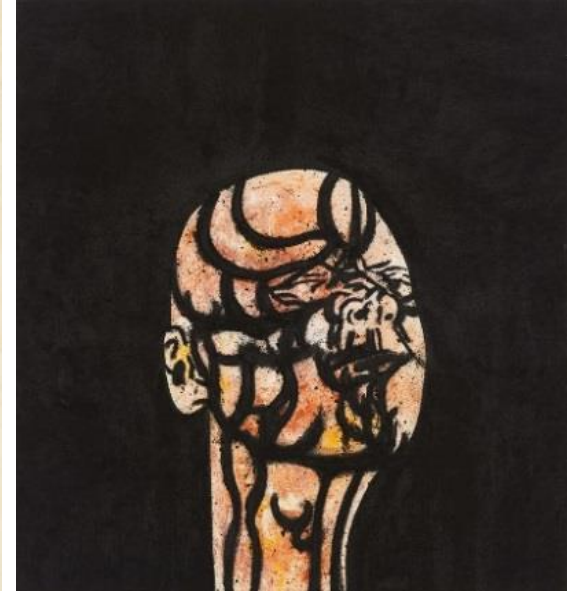
Tree 11 (PC1311), 2013, acrylic and charcoal on canvas, 165.7 x 206.4 cm. (65 1/4 x 81 1/4 in.); Self Portrait (PC148), 2014, acrylic and charcoal on canvas, 82 x 77 cm. (32 1/4 x 30 1/4 in.)