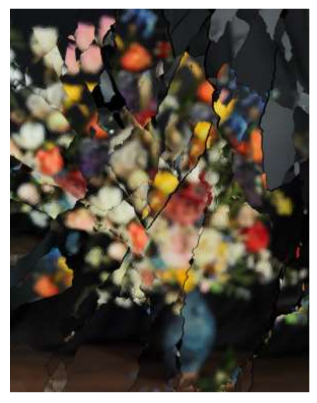
Ori Gersht, On Reflection, Material Eo1, 2014, Light Jet print, edition of 6 + 2 AP, 190 \times 148 cm. ( 74 \% \times 58 \% in.)