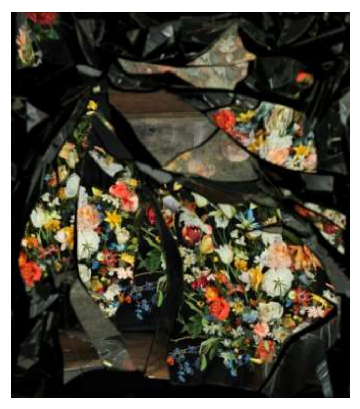
Ori Gersht, On Reflection, Fusion Bo5, 2014, Light Jet print, edition of 6 + 2 AP, 100 \times 87 cm. (39 % \times 34 % in.)