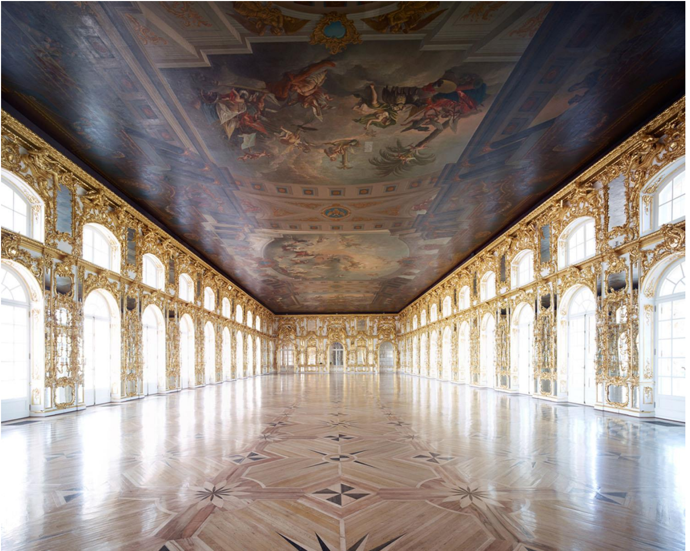
Candida Höfer, Catherine Palace Pushkin St. Petersburg III 2014, C-print, edition of 6, 180 x 209.9 cm. (70 7/8 x 82 5/8 in.)