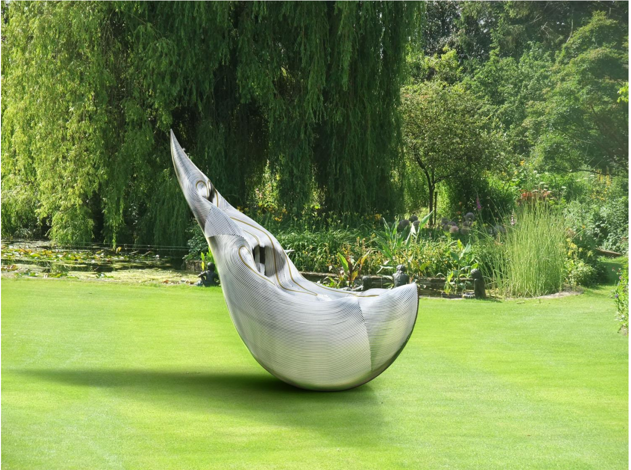
Ron Arad, Rod Gomli , stainless steel rods with single bronze rod, edition of 3, 242 x 100 x 121 cm. (95 1/4 x 39 3/8 x 47 5/8 in.)