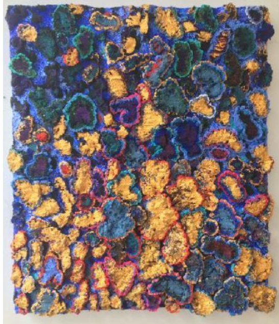
Fig 2. Nabil Nahas, Untitled , 2017, acrylic on canvas, 83.8 x 71.1 cm; (33 x 28 in.)

and became a repository for his relief paintings of layer upon layer of organic shapes covered in luminescent, hyperreal colours. Nahas often mixes pumice powder into his paint, further enhancing the materiality of his work, giving the impression of pure ground pigment or coral reefs.