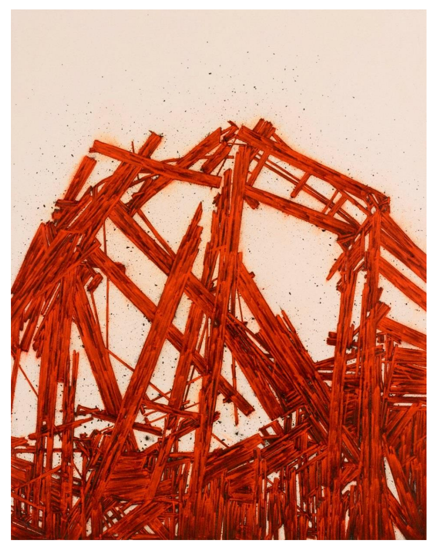
Tony Bevan, Place , 2017, acrylic and charcoal on canvas, 190 x 150 cm. (74 3/4 x 59 1/8 in.)