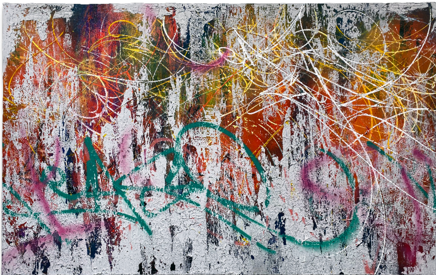
José Parlá Resilience Across the Earth , 2020 Acrylic, enamel and plaster on canvas 152.4 x 243.8 cm. (60 x 96 in.) PAR00097