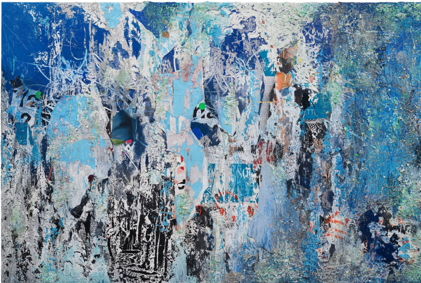
José Parlá Painting as Geomorphology , 2019 Acrylic, oil paint, collage, enamel and plaster on canvas 182.9 x 274.3 cm. (72 1/8 x 108 in.) PAR00098