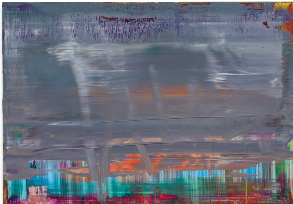
Gerhard Richter Abstraktes Bild [Abstract Painting] , 2001 Oil on Alu Dibond 50 x 72 cm. (19 \frac{3}{4} x 28 \frac{3}{8} in.) RIC00058