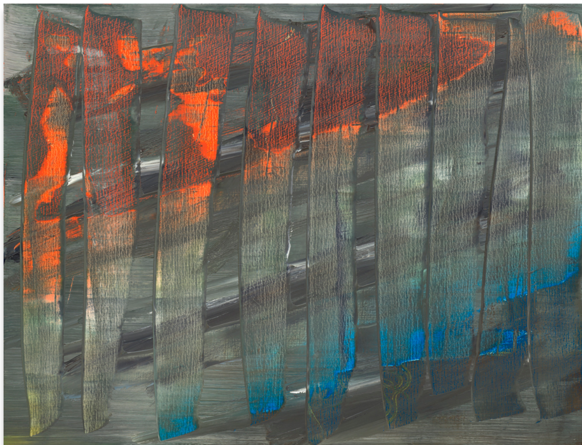
Gerhard Richter Abstraktes Bild [Abstract Painting] , 1992 Oil on canvas 62 x 82 cm. (24 \frac{3}{8} x 32 \frac{1}{4} in.) RIC00053