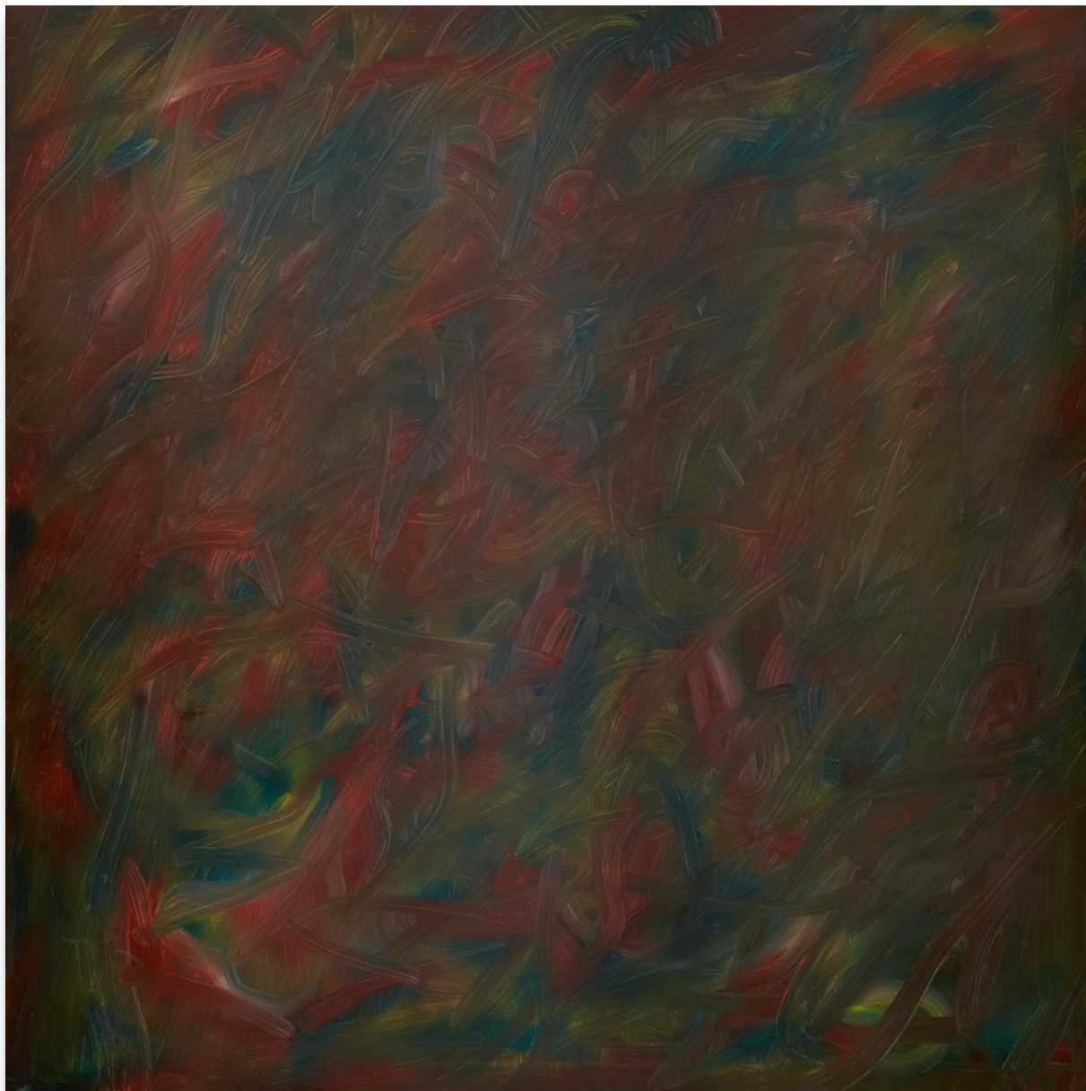
Gerhard Richter Rot-Blau-Gelb [Red-Blue-Yellow] , 1973 Oil on canvas 200 x 200 cm. (78 \frac{3}{4} x 78 \frac{3}{4} in.) RIC00046