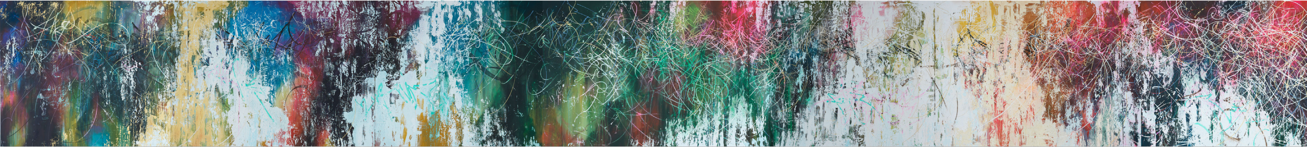
José Parlá Haru Ichiban / First Wind of Spring / Through the Tokyo Alleyways – Her Voice Sings... , 2013 Acrylic, ink and plaster on canvas 7 panels, 181.8 x 1591 cm. (71 ¾ x 626 ¾ in.) total PAR00096