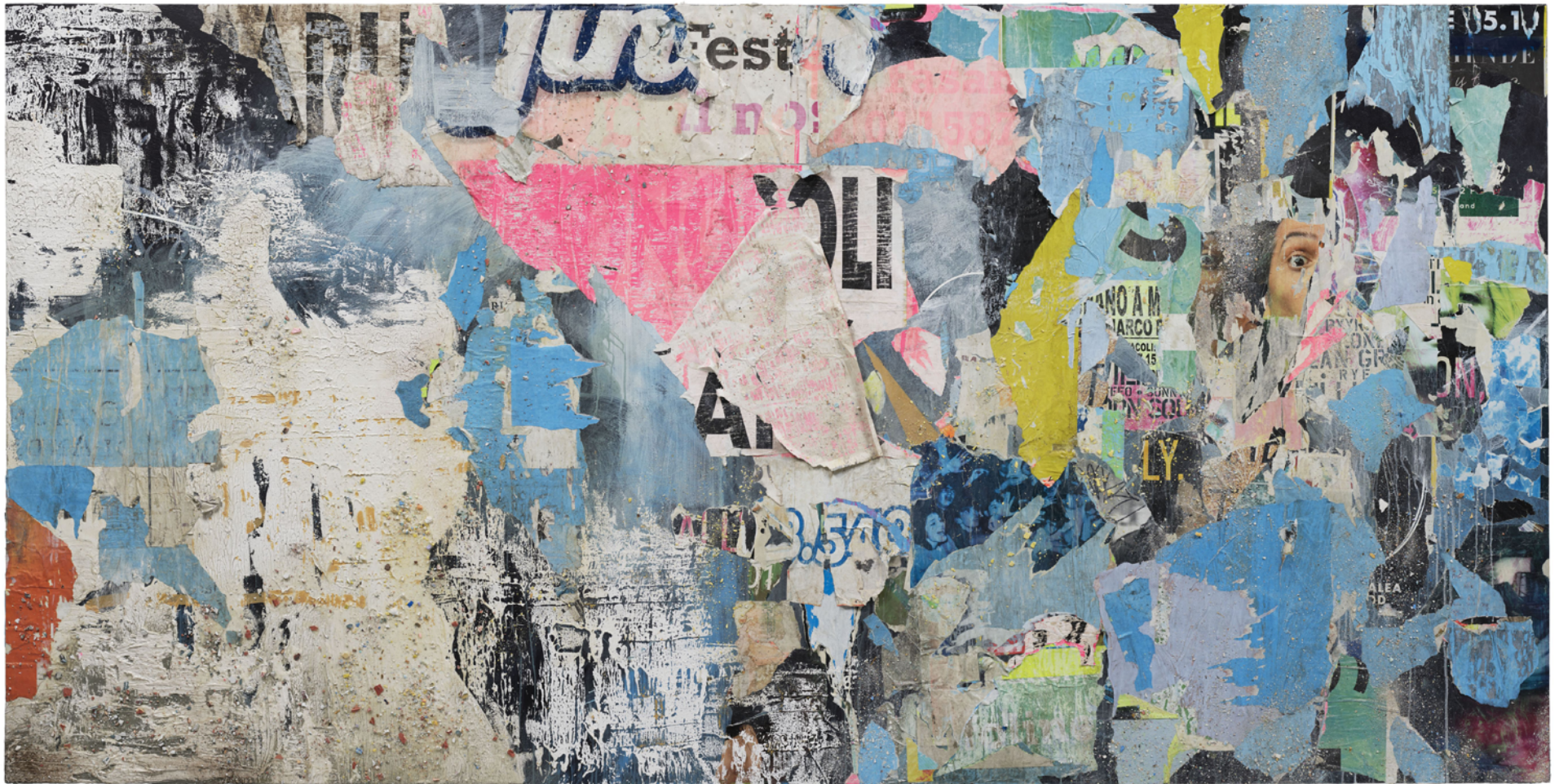
José Parlá Mirrors, Italy , 2017 Acrylic, gel medium, gesso, enamel and plaster on canvas 182.9 x 365.8 cm. (72 x 144 in.) PAR00056