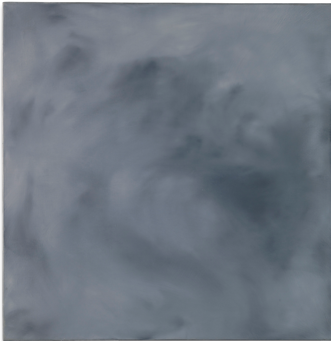
Gerhard Richter Ohne Titel [Untitled] , 1970 Oil on canvas 100.3 x 98.4 cm. (39 ½ x 38 ¾ in.) RIC00055