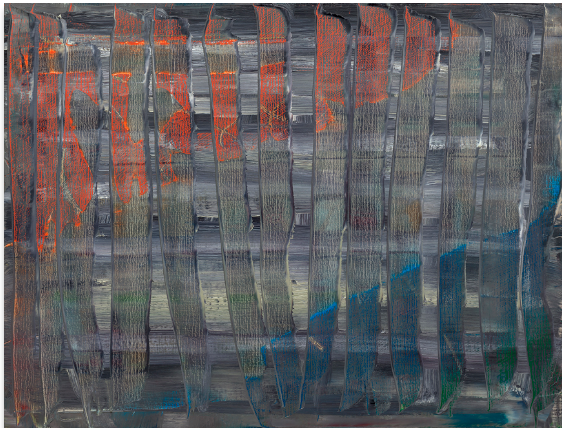
Gerhard Richter Abstraktes Bild [Abstract Painting] , 1992 Oil on canvas 62 x 82 cm. (24 \frac{3}{8} x 32 \frac{1}{4} in.) RIC00052