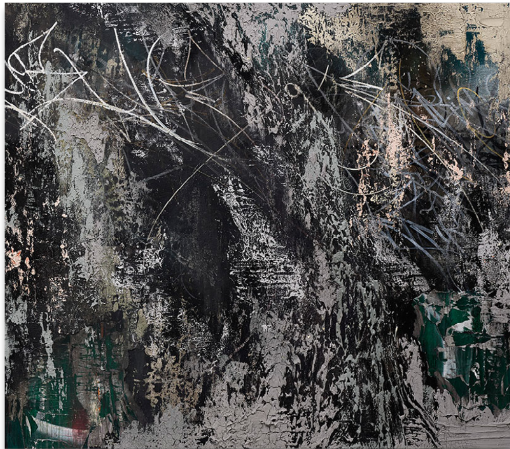
José Parlá Mannerisms of Decay , 2018 Acrylic, ink, enamel, paper and plaster on canvas 2 panels, 182.9 x 426.7 cm. (72 1/4 x 168 in.) total PAR00027