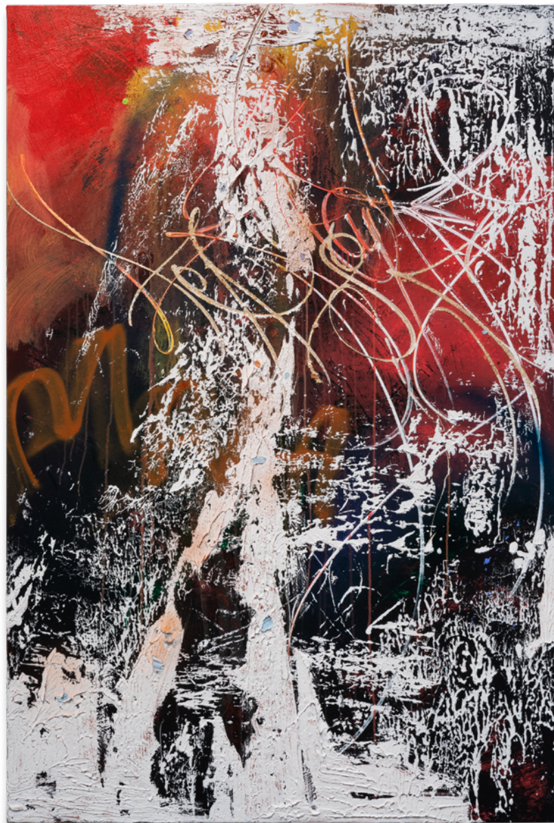
José Parlá Imprint of Body Movements , 2020 Acrylic, oil paint, collage, enamel and plaster on canvas 182.9 x 121.9 cm. (72 x 48 in.) PAR00066